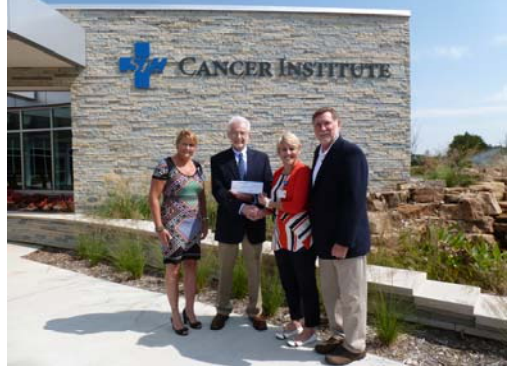
SIH Check Presentation on 17 September 2015

Since 2006, the Foundation has researched, analyzed and documented cancer data statistics for Illinois, Missouri and Kentucky to help in determining communities with the greatest need for help in the fight against cancer and for targeting intervention activities.