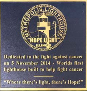
Metropolis Lighthouse Plaque

built and dedicated to the fight against cancer.