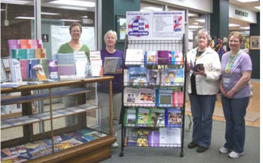
Cancer Corner in McCreary County Public Library in Whitley City, Kentucky

Public Library with 13 more to follow in Illinois, Kentucky and Missouri.