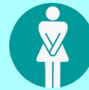
Urinary Urgency or Frequency