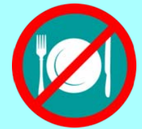
Difficulty Eating or Feeling Full Quickly